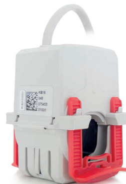
Cable split core current transformer